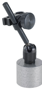
7014-10 (magnetic clamping is non-switchable)