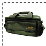
Soft Bag (optional)