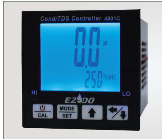
4801C Conductivity/TDS Controller