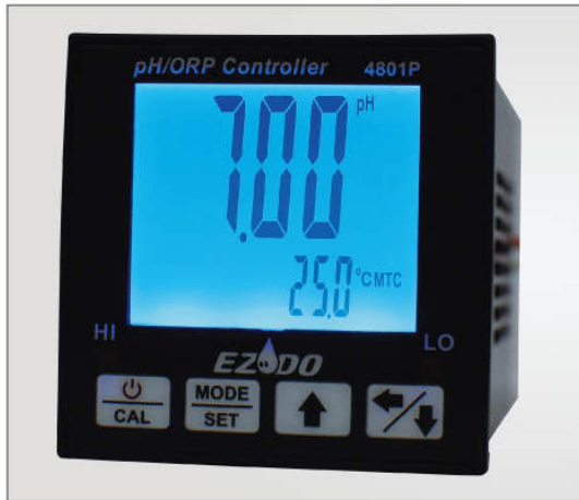
4801P pH/ORP Controller