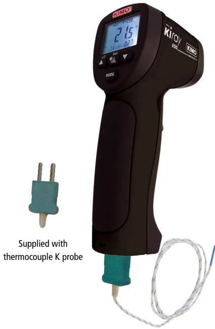
Supplied with thermocouple K probe

Infrared thermometer KIRAY 200 is an infrared thermometer used to diagnose, inspect and check any temperature. Thanks to its elaborated optical system, it allows an easy and accurate measurement of little distant targets. KIRAY 200 instrument has an internal memory which can save up to 20 measurements.